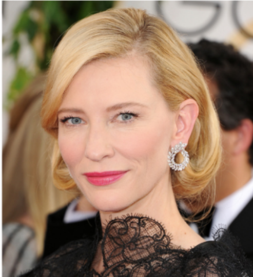
Cate Blanchett wearing Chopard earrings

Home / Style / Jewellery: Ethics and aesthetics